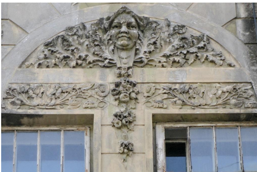
Figure 3. Female mascaróns, supplemented with bundles of ripe fruits and lush acanthus leaves on the facade of stove at Hluboka Street, 16 (architects G. Salver & I. Viniash, 1910)

To reconstruct the semantics of a female mask, the range of symbolic meanings inherent in it, it is necessary to take into account that the convergence of images of women and nature is reflected in music, poetry, Art Nouveau painting, as well as in psychoanalysis as one of the most fashionable hobbies of that time (Okunieva, 2008). Undoubtedly, the image of a modern woman is based on “archetypal representations”. C. G. Jung, who has discovered the phenomenon of collective unconscious, connects the appearance of such images with the loss of