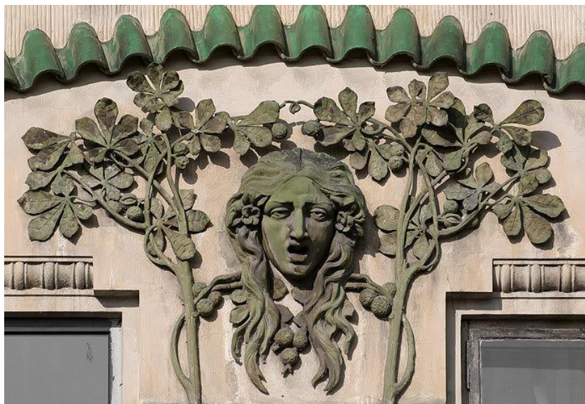
Figure 7. Expressive female mascarons on the facade of stove at Sh. Rustaveli Street, 8-8a (architect V. Sadlovskiy, sculptor T. Orkasevych, 1906)

The latter are complemented symmetrically by plant motifs and an abundant “carpet” of chestnut leaves of one of the favorite motifs of the Lviv secession – a tree typical of the streets of Lviv, its parks and squares (Biriulow, 2007; Kambarova, 2021). Such mascarons with serpentine hair are endowed with special emotionality and expressiveness. They “scream” either from pain or anger, thereby likening themselves to the image of the ancient goddesses of revenge – Gorgons, Furies, Erinyes. It is worth noting that the large mascarons that are repeated on D. Vitovskiy Street, 7, in their figurative and plastic solution are close to the allegorical image of freedom in the sculpture group “Marseillaise” by the French sculptor of the first half of the nineteenth century Francois Rude, who decorates the Arc de Triomphe on the Place de Gaulle in Paris, France (1833-1836). The disturbing, menacing artistic image of Freedom with tousled hair, distorted by a heart-rending scream, was obviously the prototype for creating the above mascarons, having a certain emotional impact on the Lviv sculptor M. Makovych.