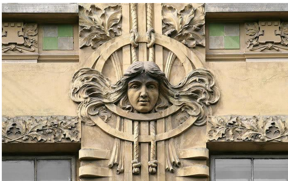
Figure 5. Exotic floral motif decorating the facade of stove at K. Levytskyi Street, 14-16 (architect T. Obminskyi for the firm of I. Levynskyi, 1907 (Architecture of Lviv, 2008)

The prototypes of various European female mascarons of this period were the works of A. Maillol and A. Rodin, paintings and drawings by Klimt, S. Vyspianskyi (Cheban, 2019). It is arguable for sure that the work of a famous Czech artist Alphonse Mucha had a certain influence on the iconography of the secession female mascarons of Lviv at the beginning of the twentieth century. It is obvious that the trends of new modern styles, in particular the “Mucha’s style”, penetrating Galicia, have made it possible to freely express original artistic ideas