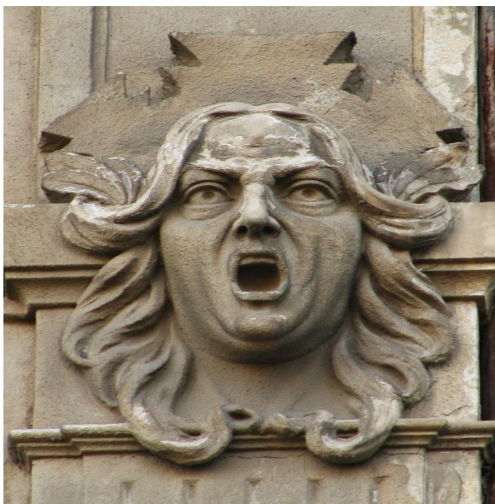
Figure 6. Expressive female mascarons on the facade of stove at D. Vitovskiy Street, 7 (architect and sculptor M. Makovych, 1905)

The demonic antipode of the “fairy of the land of flowers” is the mascarons of a vamp figure (Zhuk, 1989). A favorite type of artistic culture of the early twentieth century that is the demonic image of a vamp woman, a femme fatale, a red-haired witch of the Art Nouveau era, which was closely connected with the theatrical and bohemian environment (Kramarchuk, 2015), could not but be reflected in the architectural art of Lviv during the secession period. The combination of the real and the whimsical-fantasy is found in expressive female mascarons on the facade of stove at D. Vitovskiy Street, 7 (architect and sculptor M. Makovych, 1905) (Figure 6) and Sh. Rustaveli Street, 8-8a (Figure 7) (architect V. Sadlovskiy, sculptor T. Orkasevych, 1906).