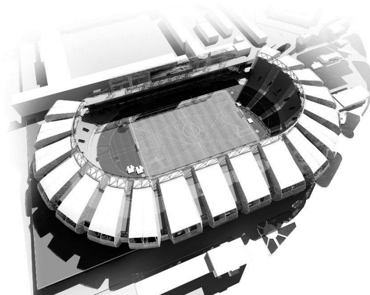
Figure 1. The concept of construction of the central arena of the stadium of the central sports club of the armed forces of Ukraine

The stadium must comply with the IAAF category, which will allow to host-level competitions for the European Championship and the European Cup inclusive. Also, let's not forget about the ambitious plans of the army to hold the Invictus Games in Ukraine – Igor Neskorenykh (see Figure 1).