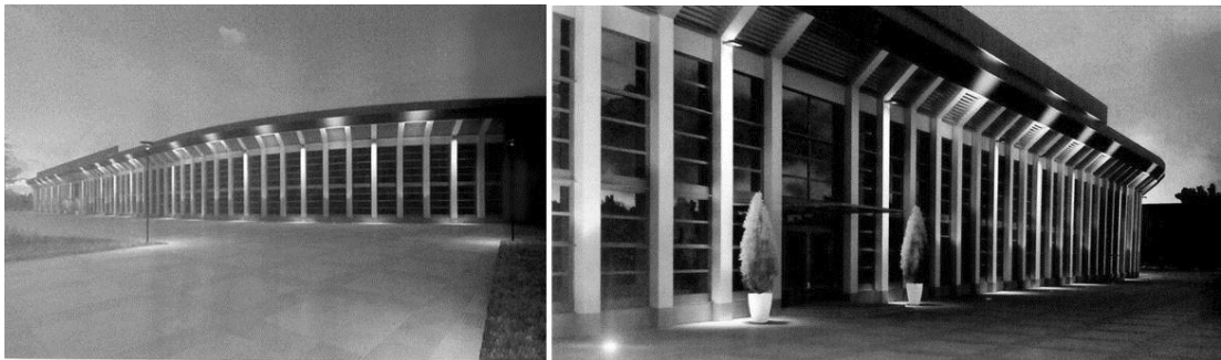
Figure 6. Design solution for the restoration of the facade of the stadium with lighting

In April 2020, repair work began at the “Metallurg” Stadium. But the much-needed building repairs began with the facade, the design solution was developed separately (see Figure 6). And it seems that this will be the only work that will be carried out at the stadium. The facade of the stadium, of course, looks bad, but the emergency basement, with falling plaster, covered with mold and fungus, look much scarier. In addition, in Kryvyi Rih it was decided to place architectural lighting on the not yet repaired facade (The Guide to Safety at Sports Grounds..., 2018).