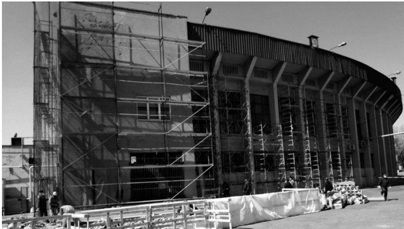
Figure 5. Kryvyi Rih stadium “Metallurg” (current state)