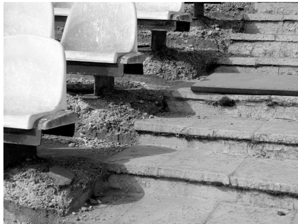
Figure 3. Unsatisfactory condition of the tribune covers the unsatisfactory condition of the tribune cover