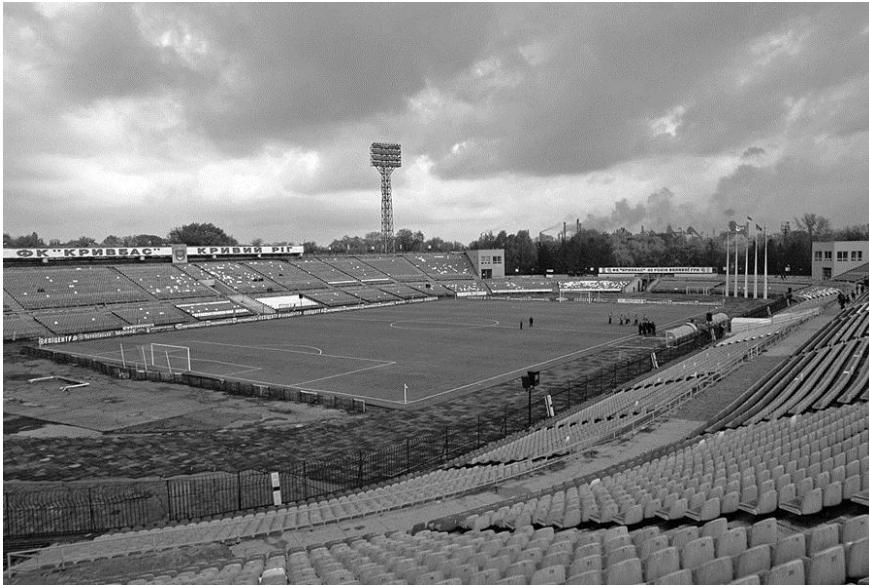
Figure 4. Kryvyi Rih stadium “Metallurg” (current state)

The return of big football in the city of miners and metallurgists are looking forward to. Fans are ready to support even the renamed project to restore the former glory of the main team of the city and re-immense themselves in the emotions of football battles (see Figure 4; Figure 5). Recently, the city of Kryvyi Rih was nominated in the private competition European Capitals and Cities of Sport Federation for the title of “European Capital of Sport”.