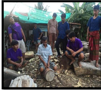
Figure 10. Workshop on “Caring for drums” for the villagers at Wai Sub-district, Wapi Pathum District, Mahasarakham Province