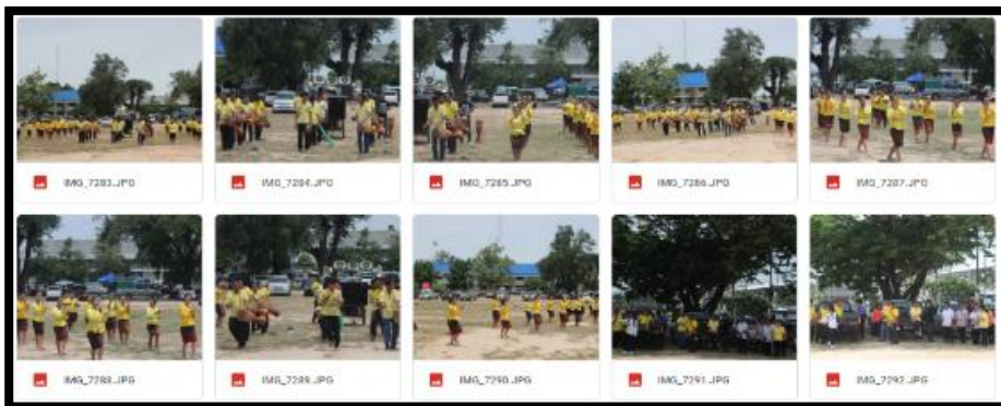
Figure 14. Seminar on “Judging Criteria for Long Drum Contest”