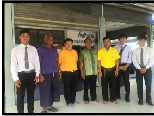
Figure 3. To have a meeting to discuss preparation with the community, Wai Subdistrict, Wapi Pathum District, Mahasarakham Province

subject matter used in the course of implementation plans at the Town Hall, Wai Sub-district, Wapi Pathum District, Mahasarakham Province, set goals, analyze, synthesize, find methods and processes to achieve the goals, and set regulatory guidelines for use in the evaluation of implementations.