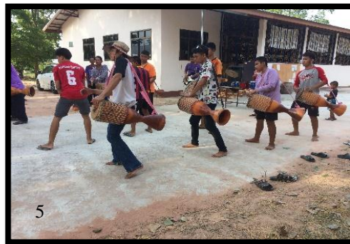
Figure 4 & 5. Workshop on “displaying long drums” for villagers at Wai Sub-district, Wapi Pathum District, Mahasarakham Province