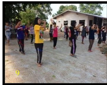
Figure 8 & 9. Workshop on "Long drum dance" for villagers in Sai Sub-district, Wapi Pathum District, Mahasarakham Province