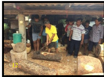
Figure 11 & 12. Workshop on “Caring for long drums” for the villagers at Wai Sub-district, Wapi Pathum District, Mahasarakham Province