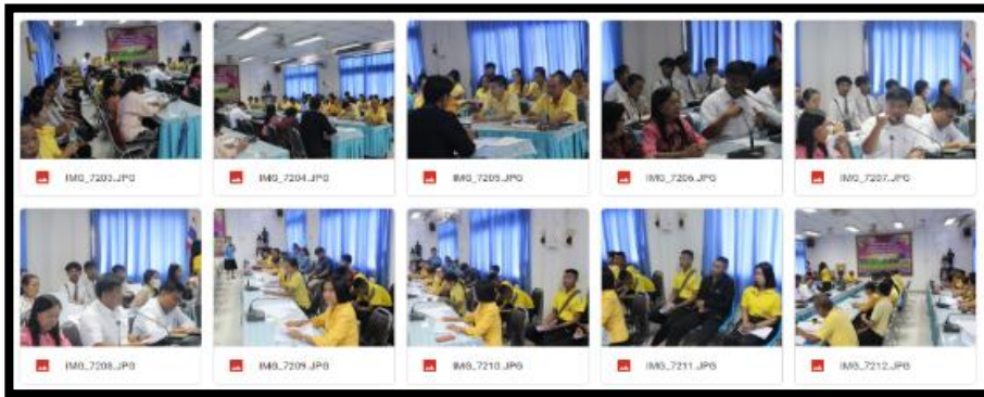
Figure 13. Seminar on “Judging Criteria for Long Drum Contest”