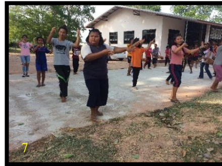
Figure 6 & 7. Workshop on "Long drum dance" for villagers in Sai Sub-district, Wapi Pathum District, Mahasarakham Province